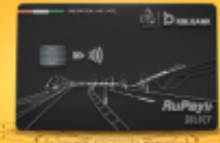
IRCTC RBL Bank Credit Card

Get Onboard with 500 Reward Points worth ₹500